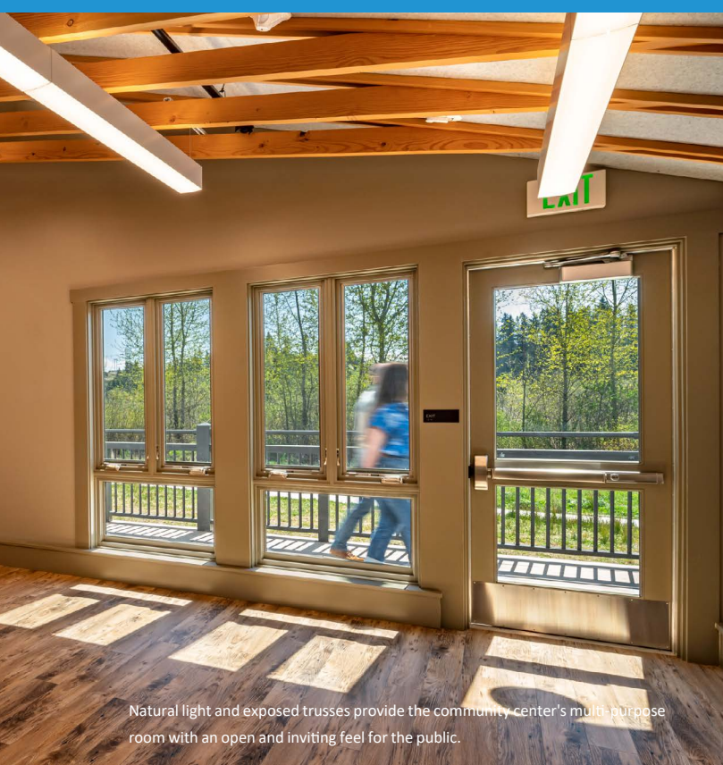
Natural light and exposed trusses provide the community center's multi-purpose room with an open and inviting feel for the public.