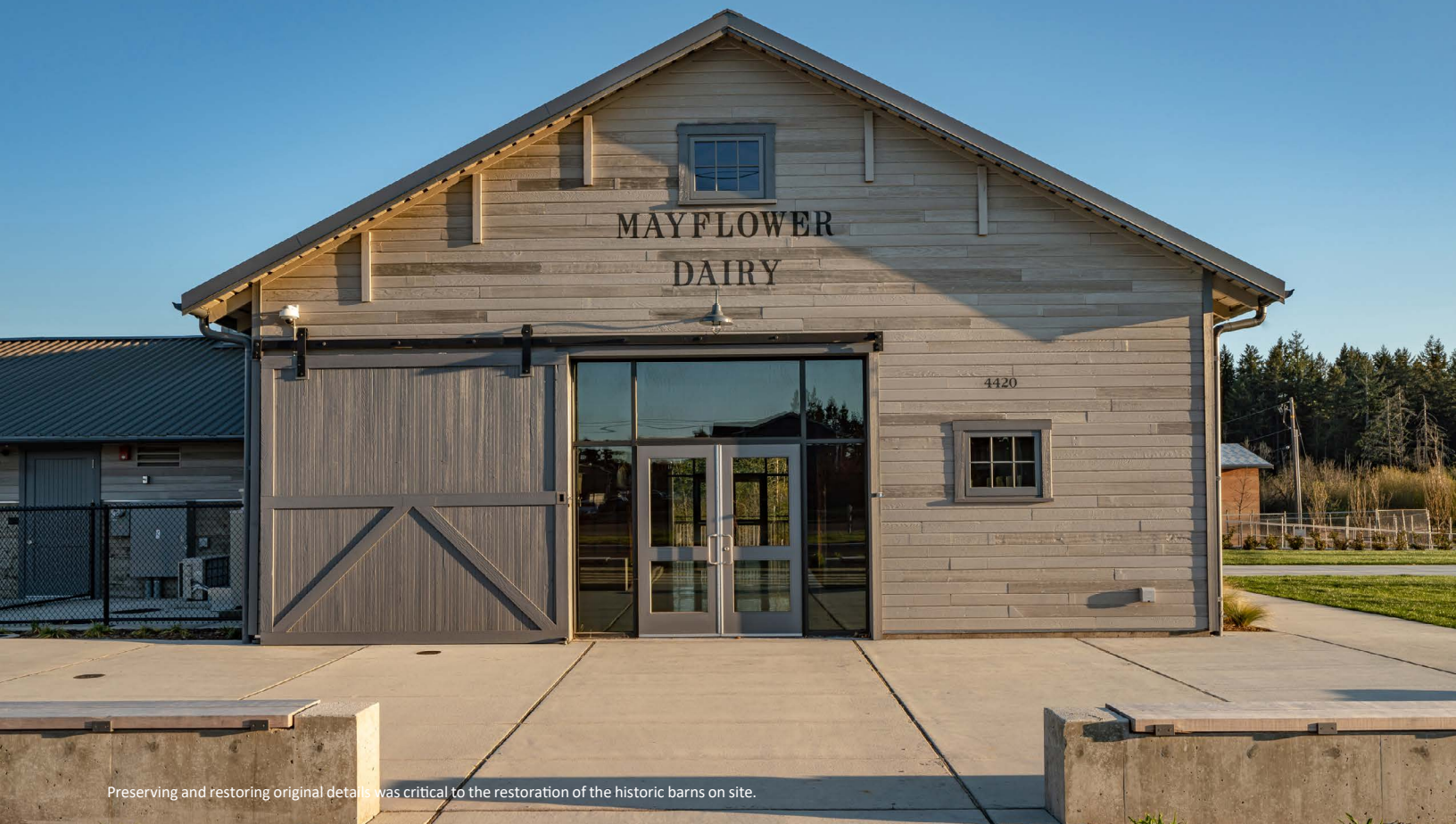
Preserving and restoring original details was critical to the restoration of the historic barns on site.