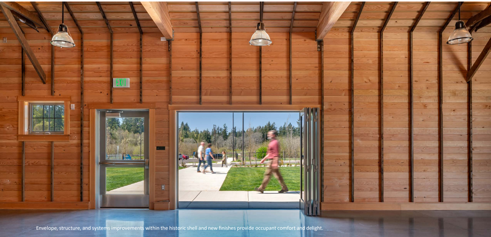
Envelope, structure, and systems improvements within the historic shell and new finishes provide occupant comfort and delight.

The overall property includes a residence leased by the County, with an access drive that bisected the project site. Fencing, security, and traffic control were carefully coordinated to allow the residents access through the construction daily for their regular activities. At each weekly construction meeting, the project team addressed any and all neighbor or public use issues. This allowed the project to move smoothly through construction without any delays or additional processes due to public relations. Utility work and paving in the right-of-way was scheduled tightly together to minimize traffic disruption and re-work for temporary paving.