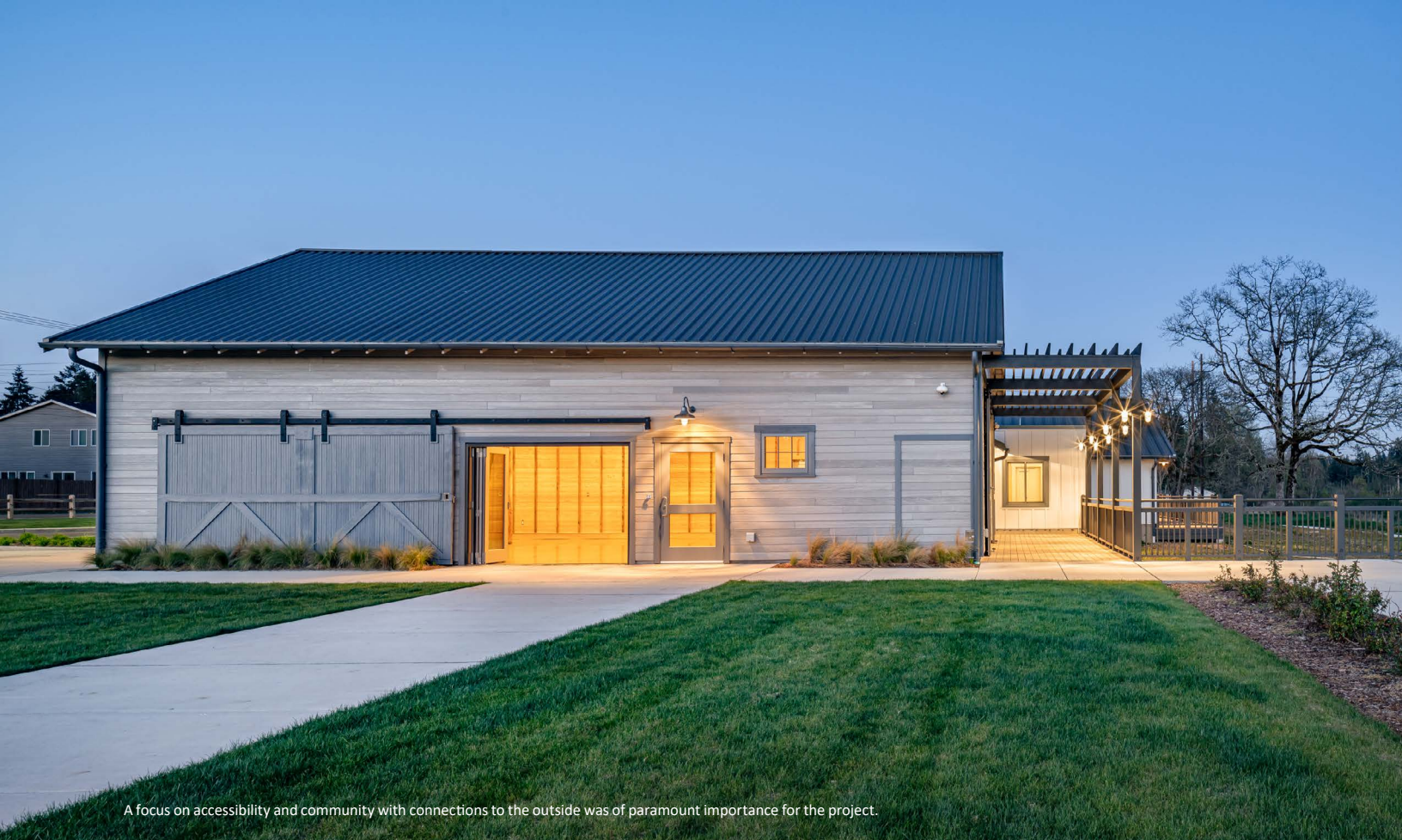
A focus on accessibility and community with connections to the outside was of paramount importance for the project.