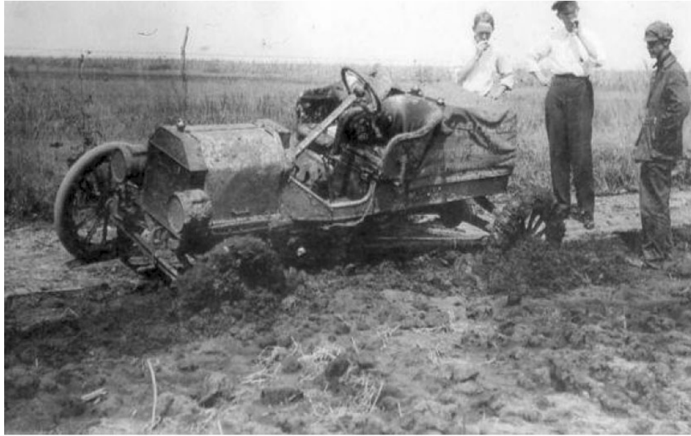
Stuck in the gumbo